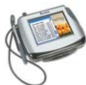
MX800 Series – The picture of perfection

MX800 Series – The ultimate in multimedia messaging and transactional capabilities. Together with VeriFone's software, the MX800 Series systems can be part of a touch screen payment solution, an identification solution or be used as a compact form of digital signage – utilizing the exceptional durability and signature capture capability of the large, sharp displays. Choose from 65,000 dazzling colors (MX850/MX860/MX870) or a 16-shade grayscale (MX830).