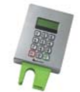
Secura – Flexibility for a variety of unattended systems

Secura – A range of certified modules designed to integrate with unattended vending, kiosk and ticket-dispensing machines. Each module delivers the security benefits of next-generation PIN entry and EMV payment technology, efficiently and cost-effectively. Choose from an all-in-one design or separate keypad/display and EMV-approved hybrid card reader.