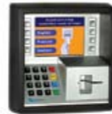
OP 4100 – Large color display for maximum multimedia impact

OP 4100 – A feature-rich, multimedia, outdoor payment solution. Perfect for a wide variety of applications for retailers such as petroleum stations, supermarkets and convenience stores. ATM-style keypad, EMV-approved hybrid card reader and contactless reader make it versatile and easy to use. Screen-addressable keys provide flexibility and support highly intuitive, interactive messaging.