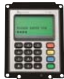
Vx 700 – Multiple payment options for the most demanding unattended environments

Vx 700 – Designed to fit perfectly into kiosk and vending bill acceptor cutouts. Supports applications for retail, ticketing and transportation, drive-thrus and petro. Fully complies with the latest PCI PED regulations and stands up to the most extreme weather and heaviest usage.