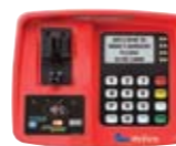
QX720 – A durable, stand alone outdoor PIN pad

QX720 – Ideal for the most challenging outdoor applications such as drive-thru lanes for QSRs and pharmacies. Rugged, weather-proof design stands up to extreme weather conditions and heavy use. Tough, dip-insertion and contactless card readers, user-friendly ATM-style interface with recessed keypad and sun-readable display allow for trouble-free, around-the-clock usage.